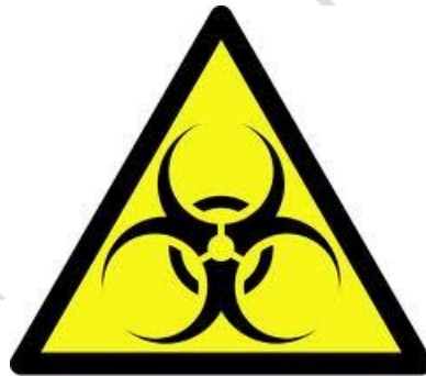
Bio Hazard Symbol